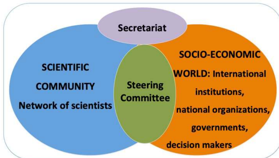
Figure 1.1 | Structure and functioning of MedECC

Since the founding of MedECC, two scientists at the French National Centre for Scientific Research (CNRS) coordinate the development and work of the network. Central to the governance of MedECC is its Steering Committee (SC, Figure 1.1) which met for the first time in April 2016 in Barcelona, Spain. The SC is currently composed of 20 members from 11 countries (Annex A.4.1), including 16 scientists in a personal capacity (representing environmental sciences, political sciences and economics) and 4 representatives of policy-making bodies: the United Nations Environment Programme/Mediterranean Action Plan – Barcelona Convention Secretariat (UNEP/MAP) and its Plan Bleu Regional Activity Centre, the Secretariat of the Union for the Mediterranean (UfM), and the Advisory Council for the Sustainable Development of the Government of Catalonia (CADS). More details on the work and accomplishments of the SC can be found in Annex A.4.1.2.