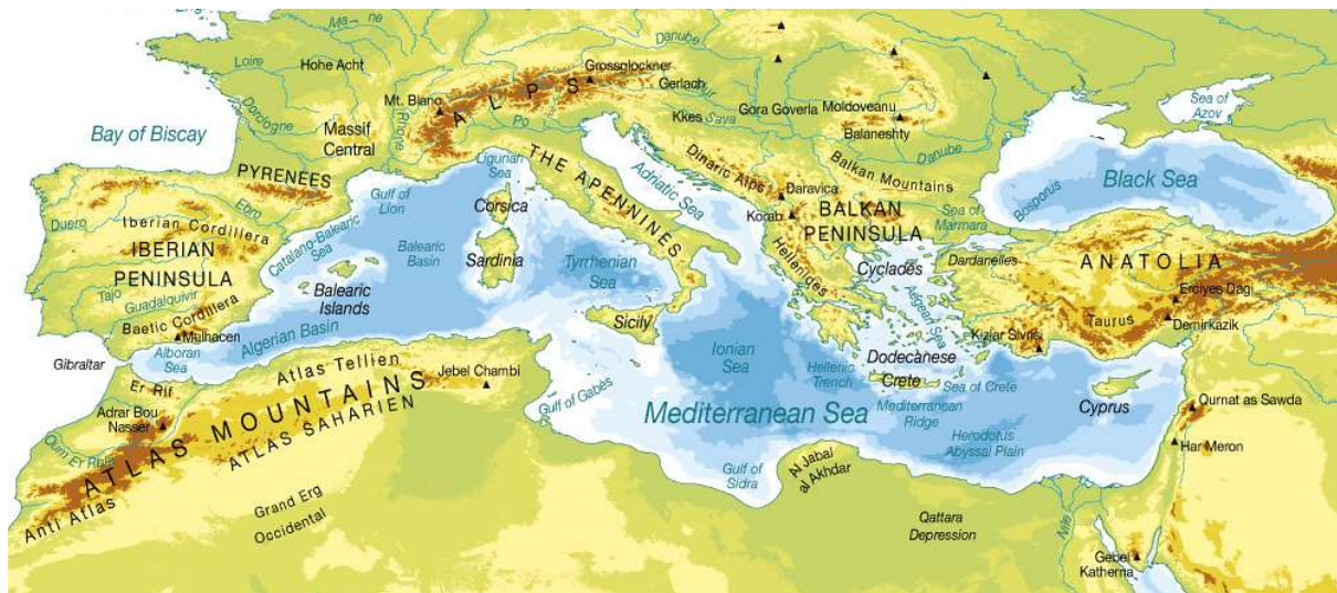
Figure 1.3 | Geography, physiography and landscapes of the Mediterranean Basin 1

In political terms, the United Nations Environment Program Mediterranean Action Plan (UNEP/MAP) 2 covers 21 riparian countries, which are Contracting Parties (CPs) to the Barcelona Convention (excluding Jordan and Portugal, which are not riparian countries sensu stricto , and Gibraltar/UK and Palestine, which are not currently CPs but have observer status). The population of this so-defined Mediterranean region is about 480 million inhabitants (EEA 2020). From a geopolitical point of view, the Union for the Mediterranean (UfM) 3 , created in 2008, embodies a much wider spatial scope of 43 countries (all the countries of the European Union and 15 countries in the southern and eastern Mediterranean).